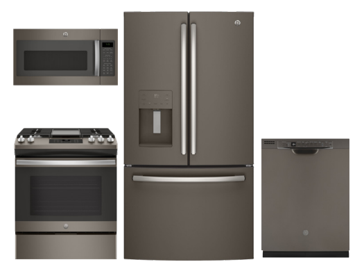
RECEIVE A $214* REBATE