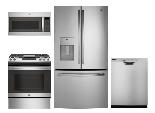
RECEIVE A $214* REBATE