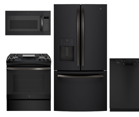
RECEIVE A $464* REBATE